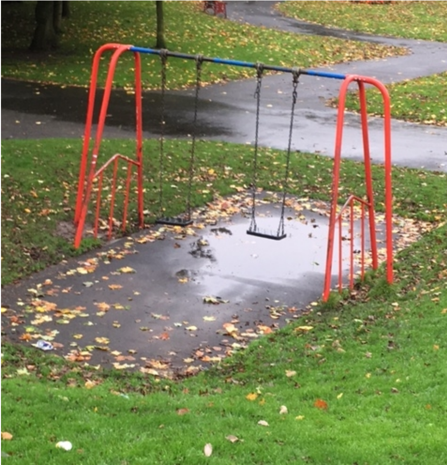
Replacement of grass matting with wetpour under double swings at Dukinfield Park £2500