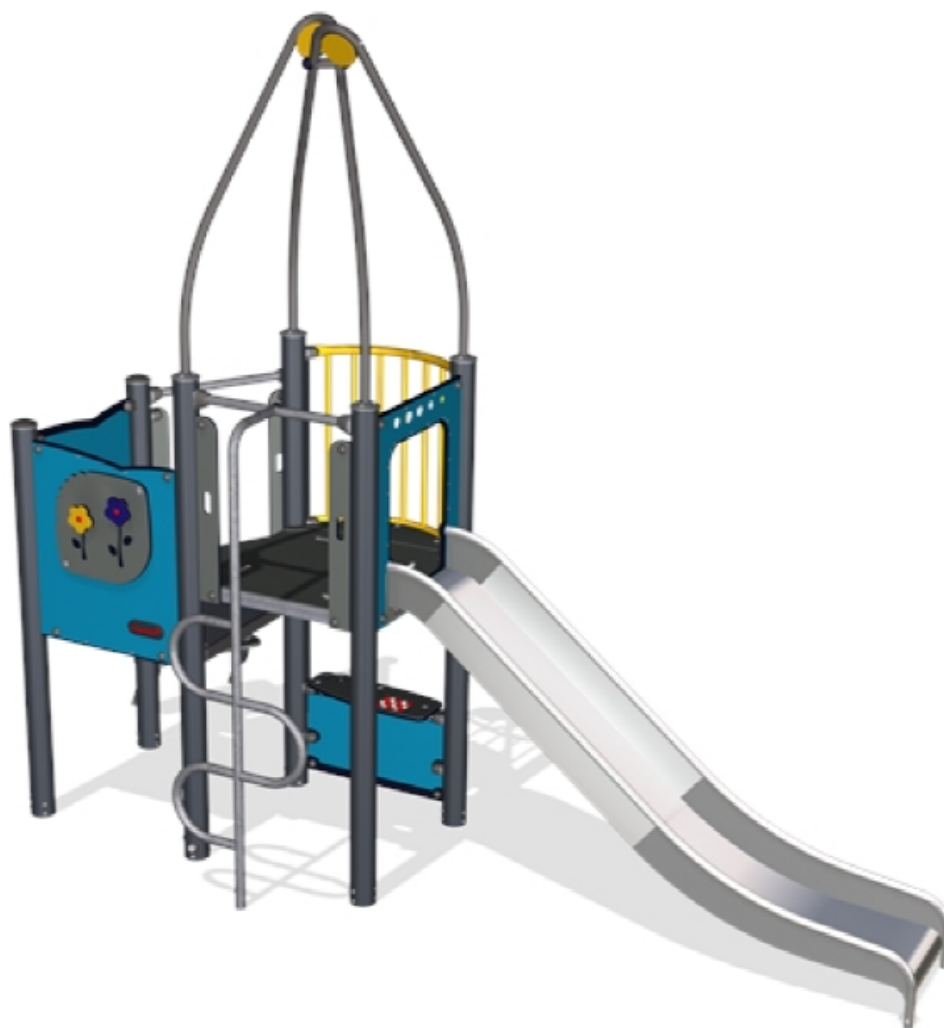
Kompan Multi Deck Play Tower with Steel posts and steel slide.